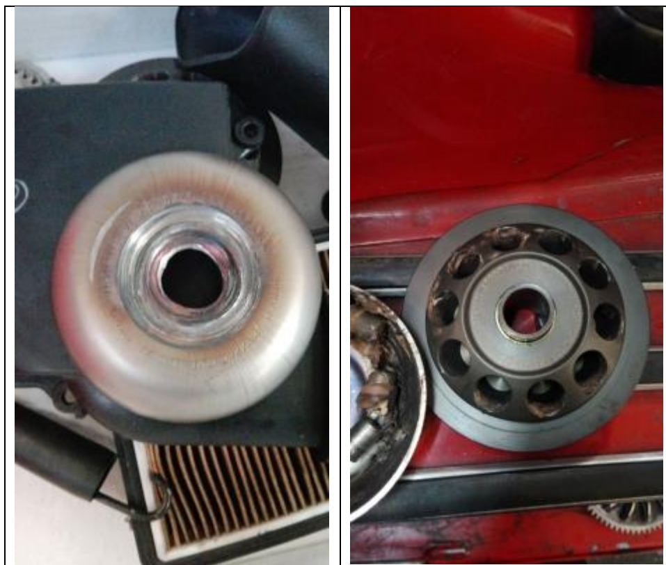
High level of incorrect mount. (wrong torque)