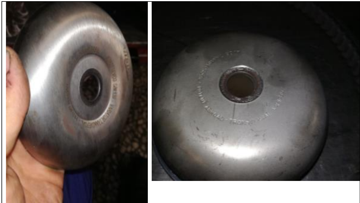
Normal level of incorrect mount. (wrong torque)

Also, it is important to put the original washers in the same position with the original variator. If it is different we put the technical specification in the mounting instructions because in specifics variators we put our washes.